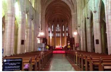
St John's Cathedral

The Memorial Garden Working bee on 4 April has been cancelled.