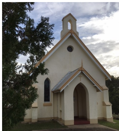
All Saints , Cobbity Crescent, Arana Hills seats approximately 200