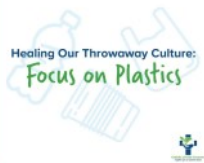
2024 Earth Day Program